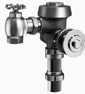
Variation Not Shown: Metal Oscillating Handle